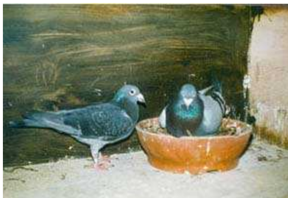
"De 90" and "De Westerhuis"