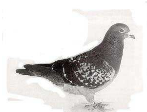
76NL1194042 "De Barcelona" 1st International Barcelona 1980